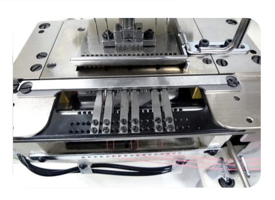
Reduces labor cost : one person operation Less thread wastage : saves 10cm (1needle) / cut Automatic needle positioning to start Less needle breakage and thread snaps

Cylinder bed, Multi-needle, double chain stitch machine with thread cutting device and elastic expanding device