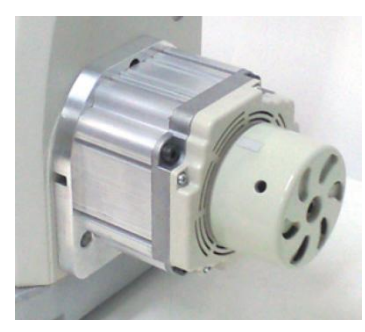
DM(Direct drive motor)