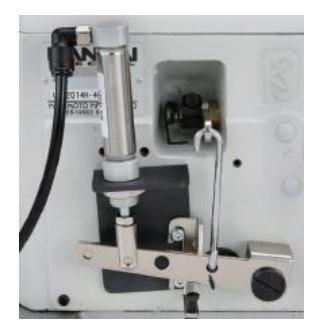
PL(Presser foot lifter)

This machine can adapt the direct drive servo motor or belt drive servo motor. Direct drive servo motor can save 75% of electricity bill than clutch motor. Servo motor is easy to control. Hence, production efficiency can increase up to 120% . Servo motor makes lower noise and lower vibration than clutch motor.