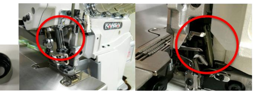
DLC coated needle bar and upper looper holder ensure durability and reliability while the machine runs in high speed.