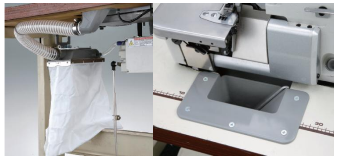
HTC(Horizontal chain cutter)