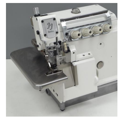
Support/Conversion plate For conventional usage