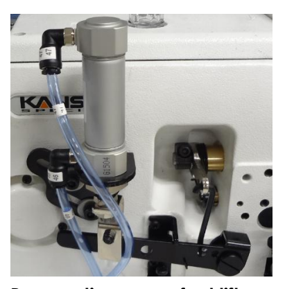
Pneumatic presser foot lifter