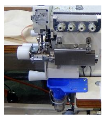
Elastic expander/ Rollers For neck part of the T-shirts, elastic band attaching for the underwear Vacuum device For collecting the cut fabric and lint

For the underwear, swimming wear etc. This device include LCD touch panel, Tape feeding device, side chain cutter, vacuum device, pneumatic presser foot lifter