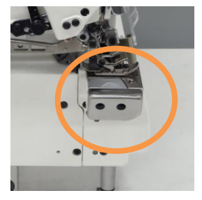
Cylinder bed 148mm circumference