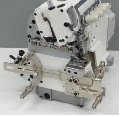
Side chain cutter(VTC) Is only available with cylinder type overlock