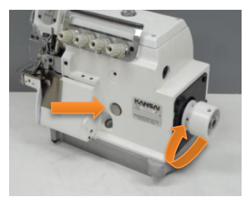
Push-button stitch length adjustment For easy operation