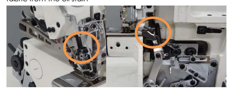
DLC needle bar and upper looper holder for oil leakage prevention, last in high speed operation