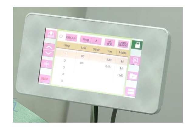
Digital elastic band metering device

For the underwear, swimming wear etc. This device include LCD touch panel, Tape feeding device, side chain cutter, vacuum device, pneumatic presser foot lifter