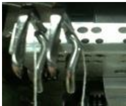
Split Type Presser Foot