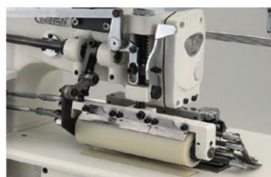
Fabric and thread catching guard