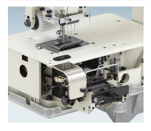
Mechanical elastic feeding device (option)