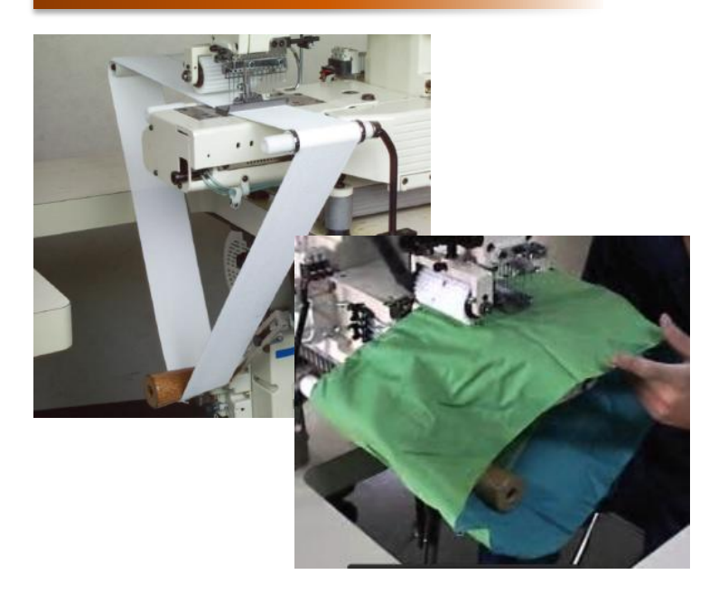
Elastic expanding device for FX models (inclusive in machine purchase)