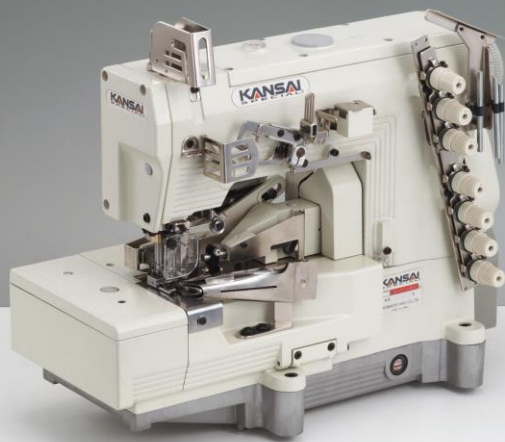
*WX8803-1S/MC31SA Folder is not included

4 needle, top and bottom cover stitch machine for the shell (scallop) stitching with tape binding