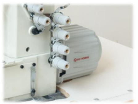
Direct drive motor

Band tape can be cut with pushing a switch on side cover. Operator performance will increase!