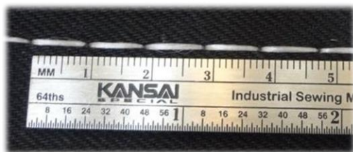
Stitch length: from 6.4mm to 12.7mm