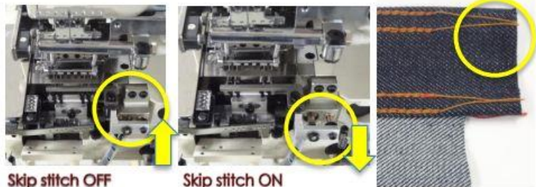
Skip stitch OFF

DOUBLE Productivity with HALF labor cost!