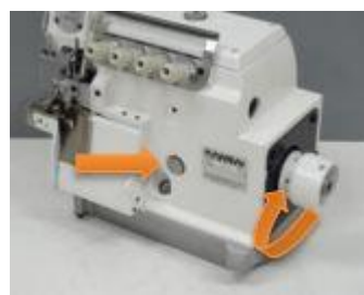
Push-button stitch length adjustment For easy operation