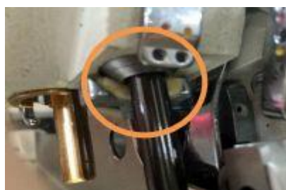
Needle bar oil return system Protects the fabric from the oil stain

Variety of optional devices are available for the high productivity.