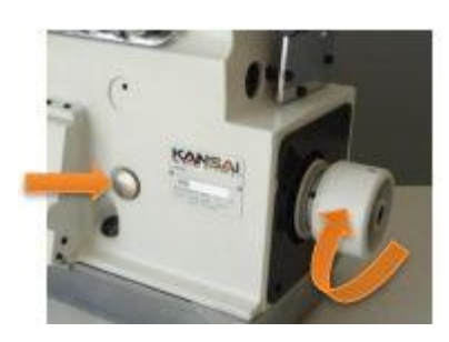
Push-button stitch length adjustment For easy operation