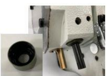
Needle bar oil seal is applied This mechanism protects the fabric from the oil stain

Variety of optional devices are available for the high productivity.