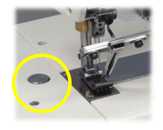
Adjusting stitch length With the push button