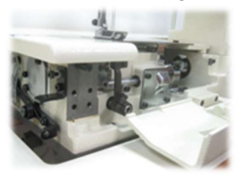
Closed oil circulation system In the feed mechanism