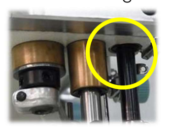
Double layered oil seals