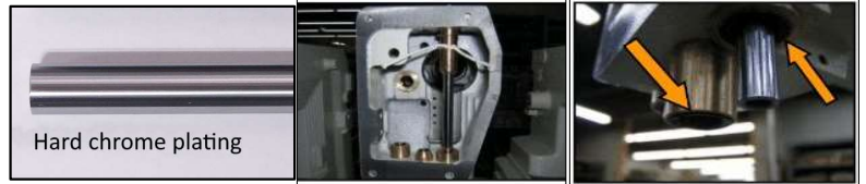
Hard chrome plating

2 needle, flatbed, bottom cover stitch, beltloop making machine with front trimmer and puller. [B-2000C/BLX series] and [NW series], flatbed machines, have been fused together to create a new model of belt loop sewing machine! It is easier to use and has reinforced oil leakage prevention.