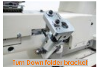
Turn Down folder bracket