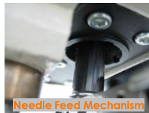
Needle Feed Mechanism