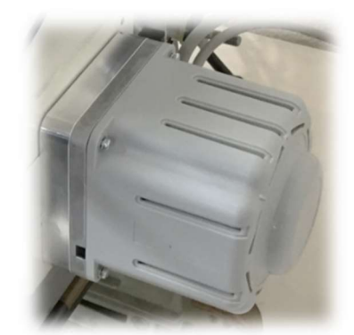
DM This machine is equipped with the direct drive servo motor